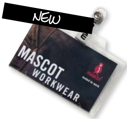
MASCOT® Kananga ID card holder 50413-990 100% polypropylen