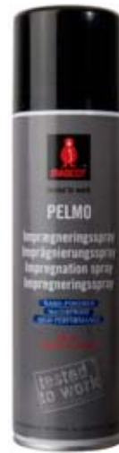
MASCOT® Pelmo Impregnation Spray FT081-980